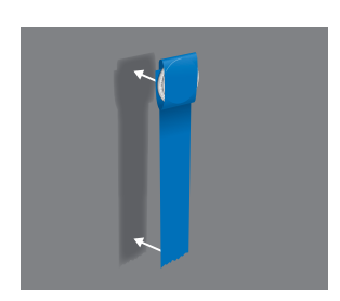
STEP 3 Firmly adhere the tape to the test surface with the quarters at the top. Allow the tape to support the quarters.